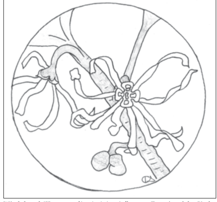
Witch hazel (Hammamelis virginiana) flowers.