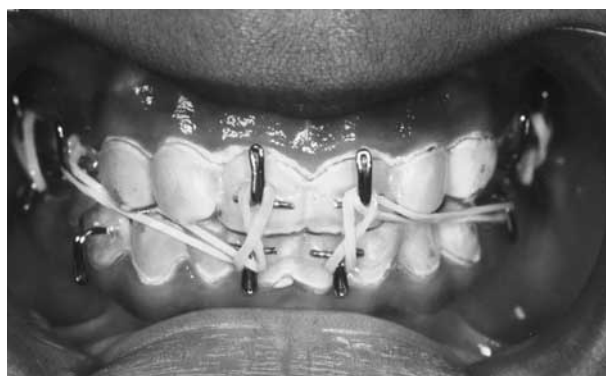
Fig. 3 Orthodontic elastics guide the patient into centric occlusion.

Using glass ionomer cement mixed to a fluid ('single cream') consistency, the splints were cemented intraorally and excess cement removed with a damp gauze swab (Fig. 2). Particular attention was paid to the occlusal