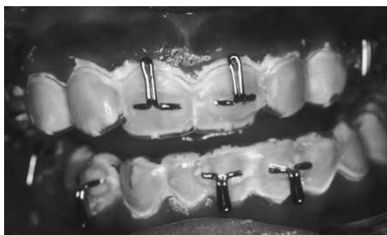
Fig. 2 Splints cemented with glass ionomer cement. The patient is unable to occlude in centric relation and the lower midline has deviated to the left.

clear. Radiographs (a dental pantomogram and postero-anterior skull views) confirmed the fracture of the left condyle, which was slightly displaced medially within the articular fossa.