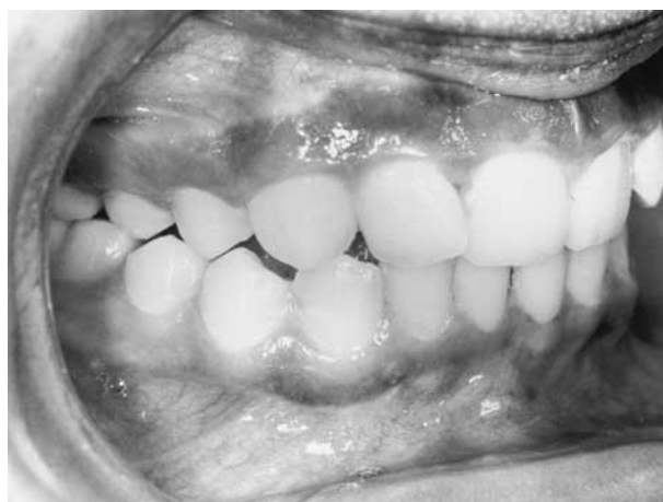
Fig. 4 Occlusion after treatment.

surfaces to ensure that the bite was not disturbed. Orthodontic elastics were positioned, with due consideration to their direction of pull, to guide the mandible back to centric occlusion (Fig. 3). The patient was reviewed at 3, 7 and 14 days later, and the elastic force was gradually reduced. The splints were removed at 4 weeks. When she was seen a week later, she was able to open her mouth fully, with some deviation to the left, and close in centric relation (Fig. 4).