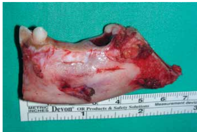
2 Resected mandible with tumor revealing amount of defect needing to be reconstructed.