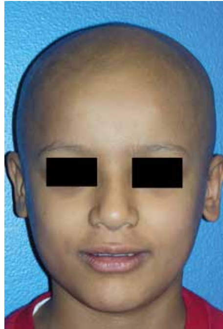
1 Preoperative image of patient. Note contour of native mandible, especially on left side.

bony defect was approximately 7 cm in length with an overlying soft tissue defect of 1-2 cm in length and 5-6 cm in width. Negative tumor margins were confirmed by frozen sections. In a simultaneous procedure, a second team comprising plastic surgeons harvested an osseocutaneous flap from the right fibula with a skin paddle attached to it (Fig. 3). The bone flap was then contoured to the previously fashioned titanium plate and was fixed to the native mandible using titanium screws. Microvascular arterial anastomosis was then achieved between the peroneal artery of the flap and the