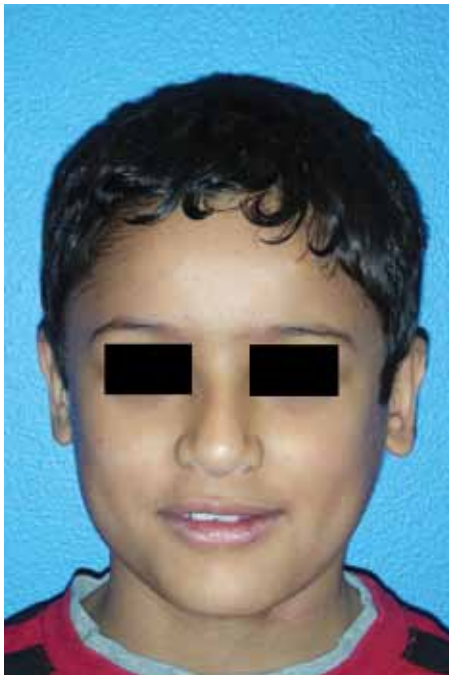
4 Seven months following successful reconstruction of mandible. Note acceptable facial contour on reconstructed (left) side. Compare with Figure 1.