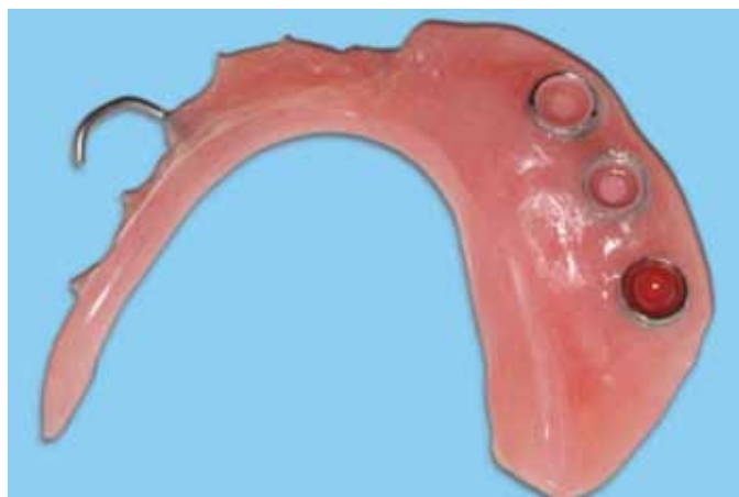
7 Completed mandibular resection prosthesis.