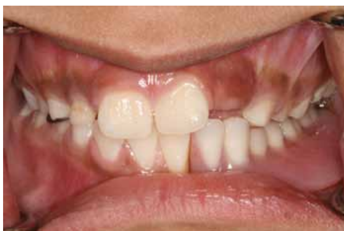
8 Frontal view of mandibular resection prosthesis in maximum intercuspation. Note buccal extension of prosthesis, which terminates on Locator abutments.

to the patient for topical application to facilitate healing (Fig. 6).