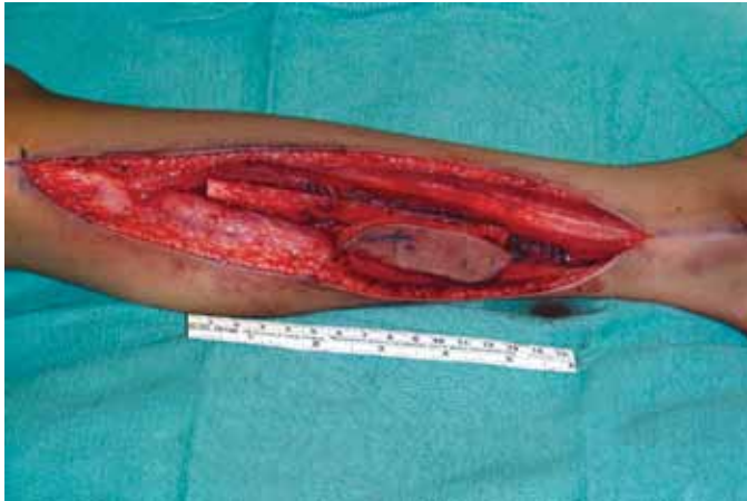
3 Fibula bone flap from patient's right leg was harvested along with skin paddle attached to it.