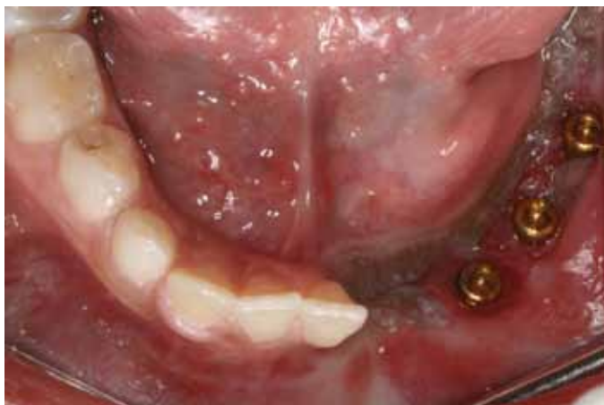
6 Soft tissues comprising skin and native mucosa around abutments reveal acceptable tissue health.