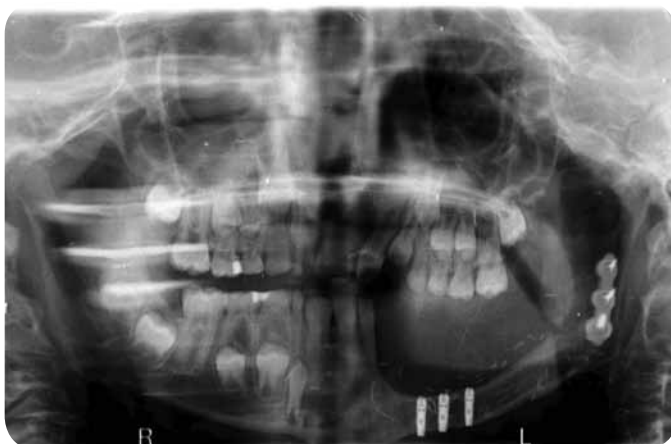
5 Panoramic radiograph showing 3 implants placed in fibula bone upon removal of titanium plate. Note amount of prosthetic material that will be required to contact occlusal plane.

facial artery, and venous anastomosis between the larger of the 2 flap vena comitans and the common facial vein stump.